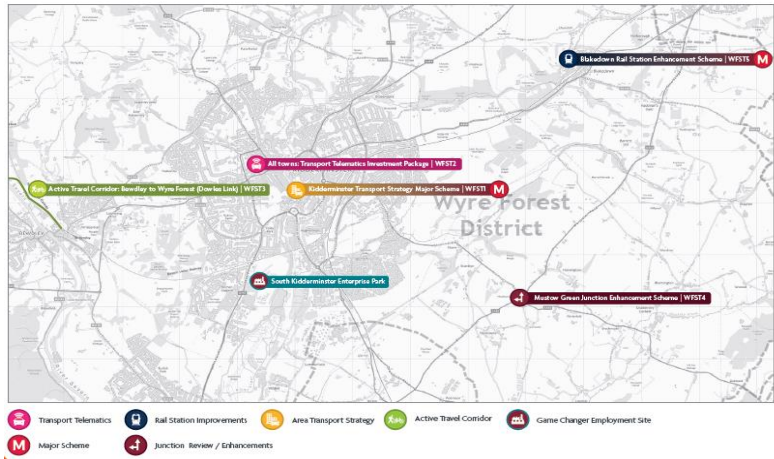
Figure 2.3: Strategic Transport schemes for Wyre Forest