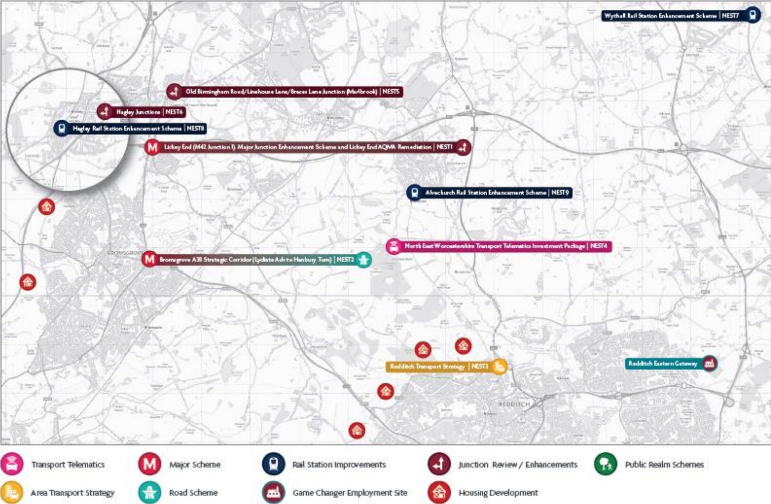
Figure 2.1: Strategic Transport schemes for North East Worcestershire